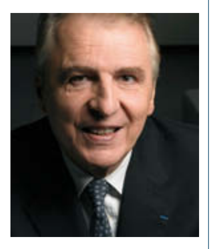
Welcome to Baselworld!

At last the moment has come for the Swiss Exhibitors to reveal the result of their diligence, excellence and passion. Guardians of centuries-old expertise, they keep this tradition alive by continuing to innovate, thus creating the new legends that will define tomorrow's time measurement.