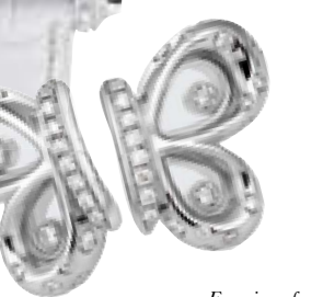
Earrings from the Happy Diamonds Butterflies collection.

The Happy Sport Tourbillon Joaillerie combines haute ioaillerie with haute horlogerie.